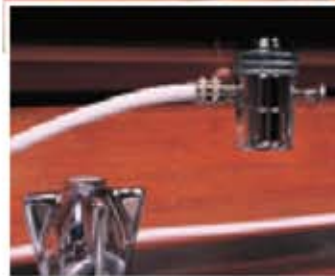
Chrome Diverter Valve