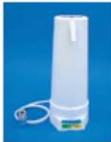
Counter Top with Moulded Plastic Spout.