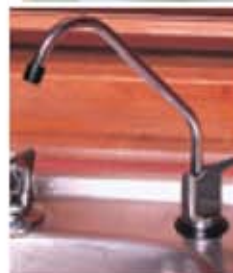
Chrome Faucet for Under-sink