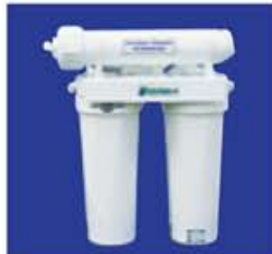
Wallmount Reverse Osmosis