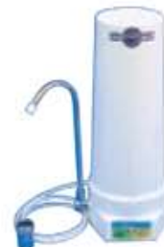
The Portable Twin Unit with Chrome Faucet.