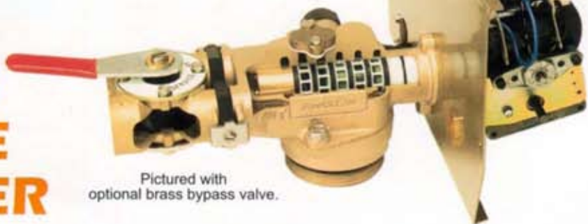
Pictured with optional brass bypass valve.